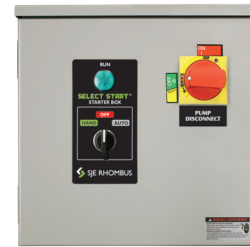
Type 3R Shown