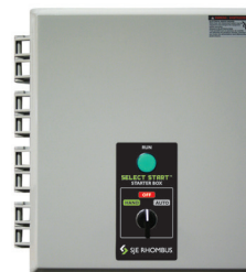
NEMA 4X Shown