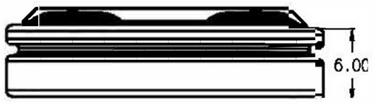
6" RISER P/N 34300028