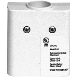
Home Temperature Monitor