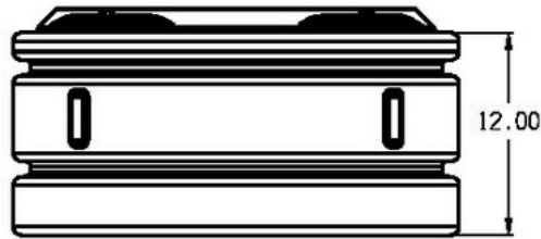
12" RISER P/N 34300029